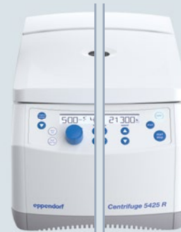
rotary knob version