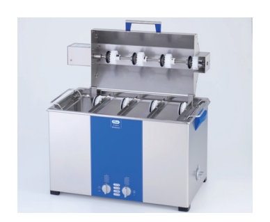
Elmasonic S 300 H