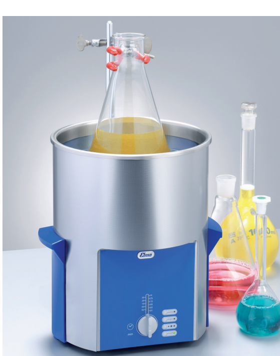
Elmasonic S 50 R