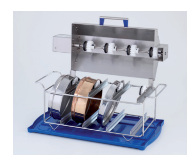
The Elma SRH sieve cleaning module