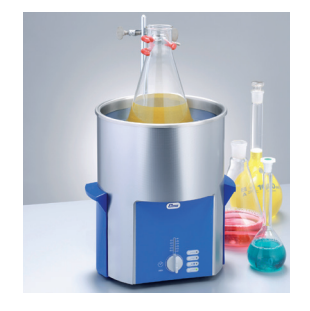
Elmasonic S 50 R