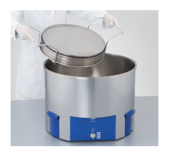
Elmasonic S 350 R