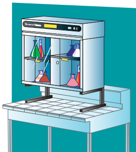
Ref : ministore 822B ministore placed on an optional base.