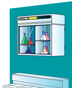
Ref : ministore 822C ministore mounted to a wall.