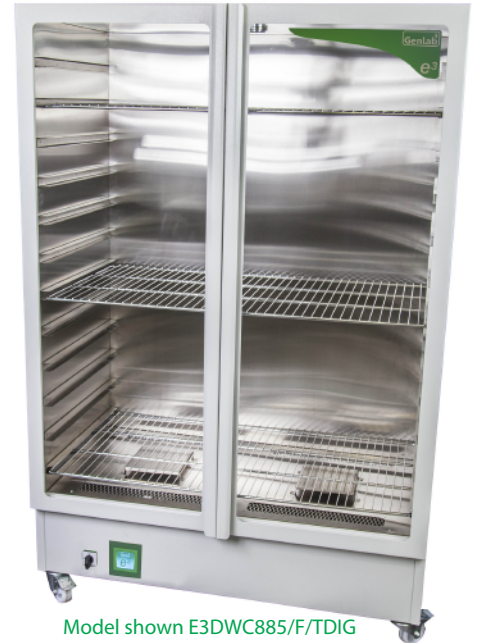
Model shown E3DWC885/F/TDIG

Genlab is proud to offer their customers a unique range of sustainable laboratory products and services. e 3 is our market leading brand for scientifically developed, cutting edge, sustainable, eco-friendly products. Genlab's new e 3 range of glassware drying cabinets are energy efficient, safer and economic to run. Working with the University of Cambridge, we developed units that represent a novel, sustainable solution to glassware drying. They feature our latest touch screen control system, which offers intuitive control and excellent accuracies with bespoke firmware for energy saving control, including adjustable automatic on/off times.