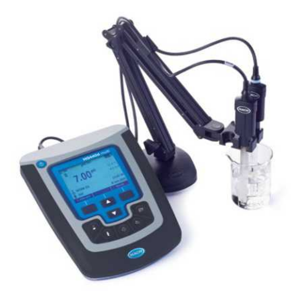
HQD benchtop multi-meter