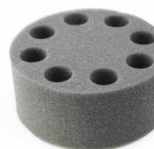
VT1.3.5 Tube adaptor 8 holes 20mm diameter