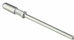
VT1.2 Tube adaptor holding rod