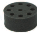
VT1.3.4 Tube adaptor 8 holes 16mm diameter