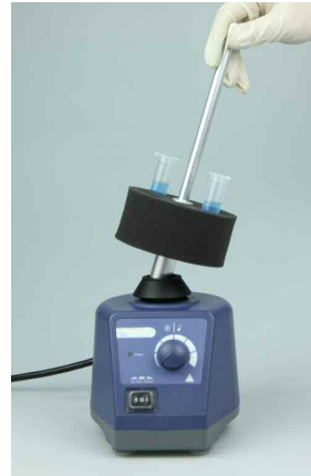
MX-S with VT1.2 Holding Rod and Tube Adaptor VT1.3.4 for Touch Operation

Cat No: 18900044 VT1.2 Tube holding rod used with tube adaptors Cat No: 18900035 VT1.3 Universal top plate Ø100mm Cat No: 18900020 VT1.3.1 Tube adaptor for 48 holes [tubes Ø6mm] Cat No: 18900021 VT1.3.2 Tube adaptor for 18 holes [tubes Ø10mm] Cat No: 18900022 VT1.3.3 Tube adaptor for 12 holes [tubes Ø12mm] Cat No: 18900023 VT1.3.4 Tube adaptor for 8 holes [tubes Ø16mm] Cat No: 18900024 VT1.3.5 Tube adaptor for 8 holes [tubes Ø20mm] Cat No: 18900043 VT1.3.6 Platform pad for Ø99mm tubes and vessels