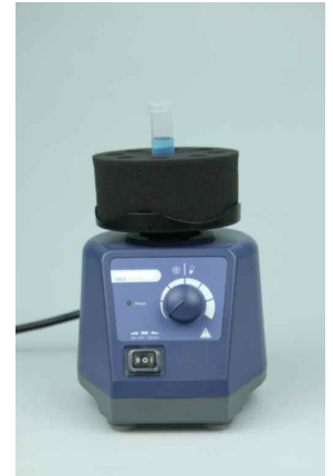
MX-S with VT1.3 Universal Top Plate with Tube Adaptor VT1.3.4 for Continuous Operation