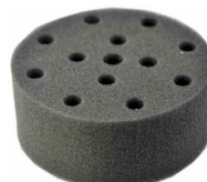
VT1.3.3 Tube adaptor 12 holes 12mm diameter