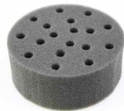
VT1.3.2 Tube adaptor 18 holes 10mm diameter