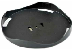
VT1.3 Universal top plate 100mm diam for use with tube adaptor for continuous operation