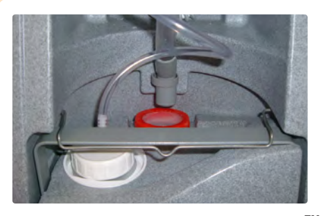
Ensure that the TEALtainer is clipped in position before closing the panel. Empty and clip in place when moving or lifting the unit.

The TEALtainer<sup>™</sup> contains a fresh water bag with a white cap & connector and a waste bag with a red cap. The fresh water cap has a pickup pipe and filter attached to its end. It is recommened when filling to remove the white cap but leave the pipe in the bag to minimise contamination.