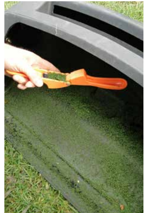
Collect verdure samples—aboveground parts of the turf plant remaining after clippings removed. A golf-ball sized, compressed verdure sample is usually sufficient to produce adequate sap for the test.