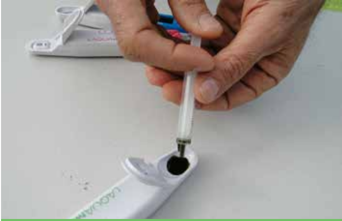
Place some drops of the extracted sap directly into the sensor.