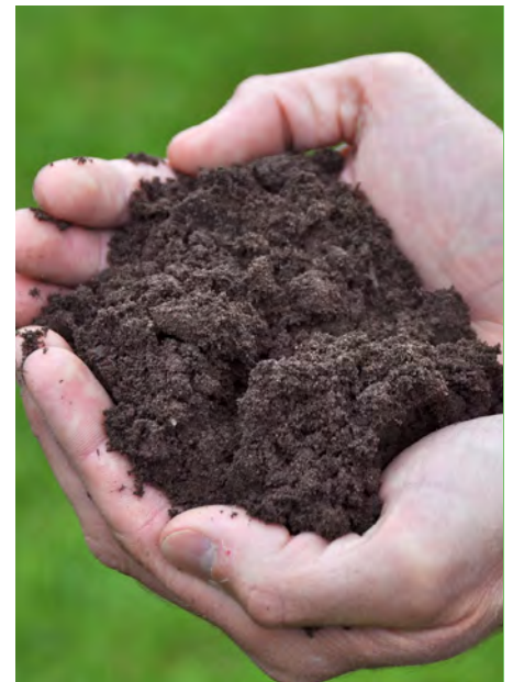
Collect dry soil samples and pass through a 2mm sieve.