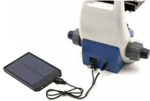
B-192 Powered by solar battery pack (M-069)

Included battery: rechargeable – Lithium-Poly. Capacity: 2600 mAh. Output voltage: 5,5Vdc. Dimensions: 120x73x10 mm. Autonomy: over 6 hours at medium intensity (X-LED 3 ). Charging modes: with solar panel (12h), with external USB power supply (not included) or from PC USB port (5h).