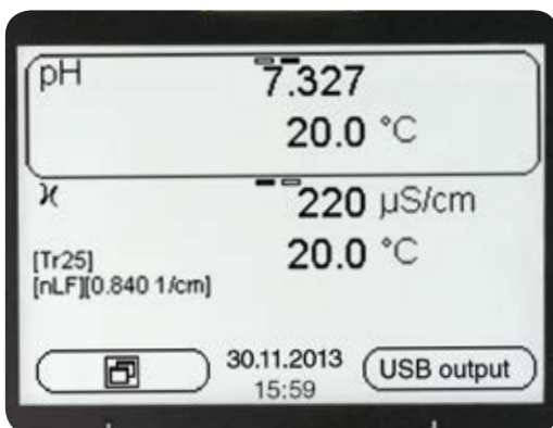
Display with two measured values