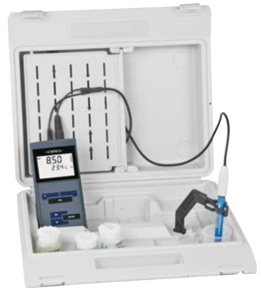
Set in case