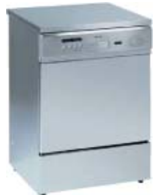
CUB Easy 600x600x850mm

The standard racks hold a variety of beakers and flasks on wire pegs. For narrow necked flasks the Jet Rack has specific supports with injection nozzles for injecting water and detergent directly into the glassware.