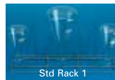
Std Rack 1

The standard racks hold a variety of beakers and flasks on wire pegs. For narrow necked flasks the Jet Rack has specific supports with injection nozzles for injecting water and detergent directly into the glassware.