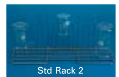
Std Rack 2