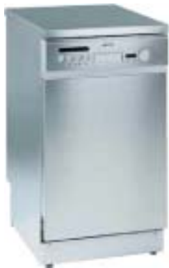
CUB Compact 450x600x850mm

Both units are quiet and can be installed in the lab and the pre programming makes them easy to use. They operate on 1 or 2 levels and are suitable for a wide variety of glassware. All offers include 40L of neutralising liquid and commissioning which covers checking the installation and operation as well as user training.