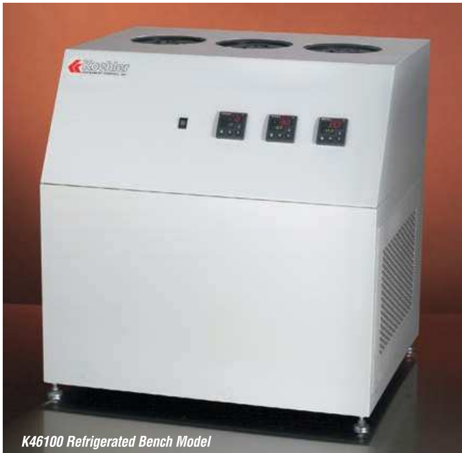
K46100 Refrigerated Bench Model