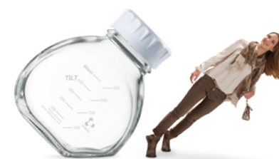
TILTING DURAN® TILT

The additional of a fused, external amber layer ensures the contents are protected from the effects of photodegradation. The protection meets international standards and lasts the lifetime of the bottle.