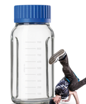
SWIRLED DURAN® BAFFLED

All the features of the ORIGINAL GL45 DURAN® bottles, with the added benefits of a larger mouth. Hassle-free filling, emptying, and cleaning, are just some of the benefits of having easier access.