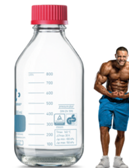
STRONGER DURAN® PRESSURE PLUS+

Combining the best of both worlds, the virtually inert glass protects the contents from contamination, while the external plastic safety coating protects both the user and contents from accidents.