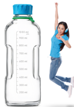
SMART DURAN® YOUTILITY®

The gold standard of multi-functional laboratory bottles made of a high-purity borosilicate glass 3.3. A combination of high-performance materials and robust design provides a long usable working life.