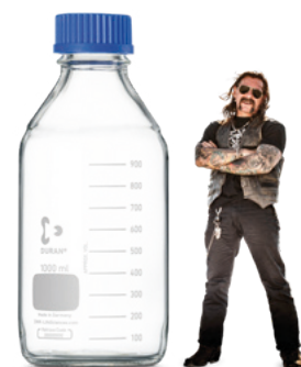
ORIGINAL DURAN® ORIGINAL GL45

The bottles come with a comprehensive range of caps, connection systems and accessories that allow you to put together your own individual system for high-precision applications.