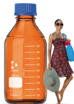
UV-PROTECTED DURAN® AMBER

Retaining the best features of the original bottle, this next-generation of laboratory bottles offers improved ergonomic features, user safety, and a dedicated system of useful components.