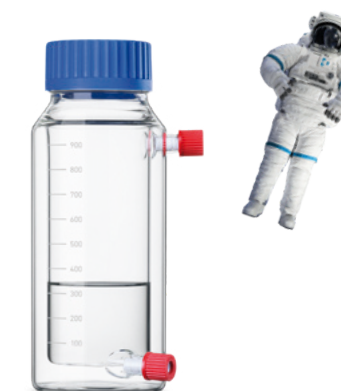
ISOLATED DURAN® DOUBLE WALLED

The ultimate bottle for high-efficiency mixing combined with the benefits of the wider GLS80® mouth. The built-in glass baffles improve top-to-bottom circulation and radial mixing.