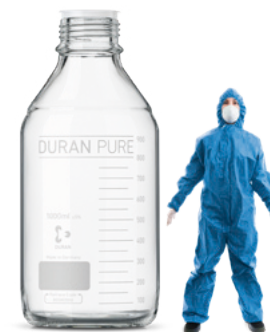
PURE DURAN® PURE

The smart, reusable bottle for cell culture media preparation. The unique design offers two positions: upright for filter sterilization or storage, and tilted at 45° for pipetting in biosafety cabinets.