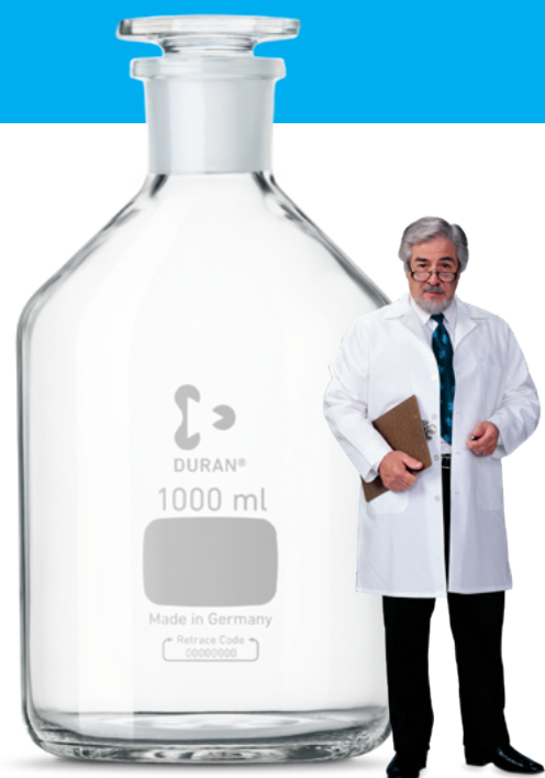
TRADITIONAL DURAN® REAGENT BOTTLE