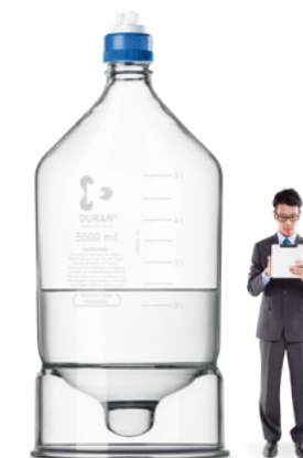
EFFICIENT DURAN® HPLC

A range of high-quality bottles and closures developed for the needs of the pharmaceutical industry. The bottles meet the requirements of the international pharmacopeias and are available with the certificates required by the regulatory authorities.