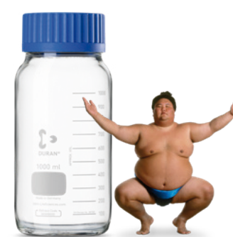
EXTENDED DURAN® GLS 80®

A stronger-built bottle that offers a safer option for laboratory applications involving vacuum or moderate pressure. Safely extends the range of possible applications for glass laboratory bottles.