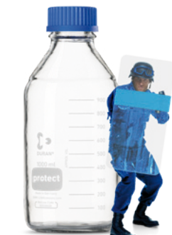
PROTECTIVE DURAN® PROTECT

Close and efficient packing is the benefit of the space-saving shape. Ideal for the shipping and storage of high-demand materials. For reagent supply to instruments where bench space is at a premium.