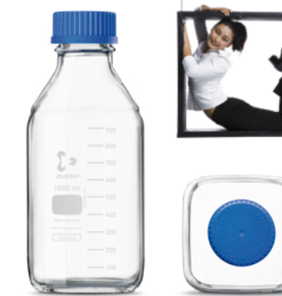
SPACE-SAVING DURAN® SQUARE

The optimized conical design allows the most efficient delivery of mobile phase to HPLC analyzers. Graduated for easier volume determination. The virtually inert glass prevents leaching of extractables.