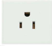
Socket for EACH water system & leak detector