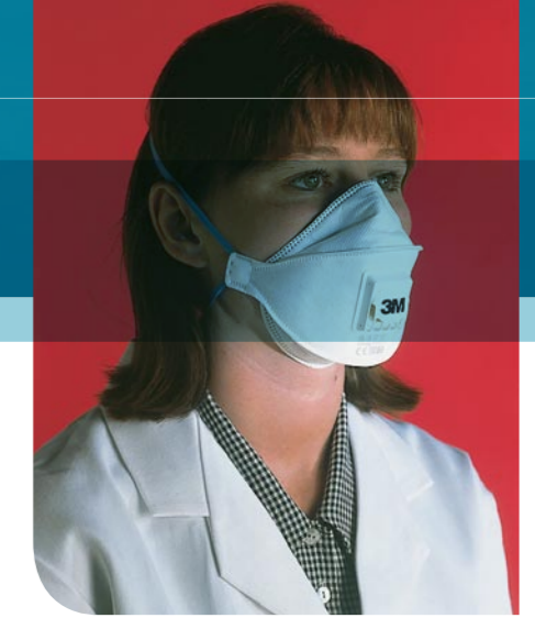
Disposable Particulate Respirators ("Dust Masks")