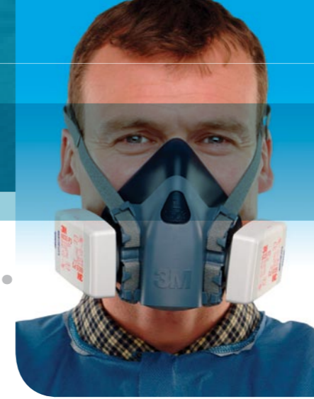
Reusable Half Masks

Please note that in order to carry out a full fit test, ALL the steps detailed below must be followed (Parts 1+2).