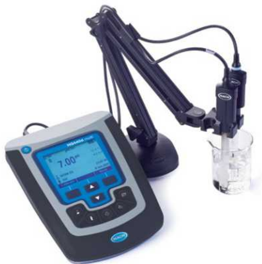
HQD benchtop multi-meter