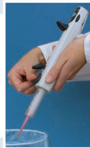
Dispenser tip ejection