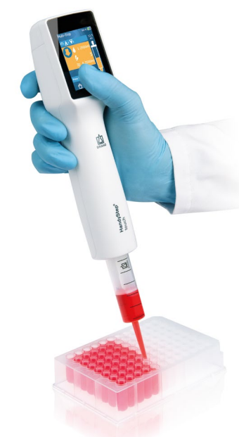
Multi dispensing with the HandyStep® touch and PD-Tip //

The HandyStep® touch saves time and prevents errors through automatic tip size recognition of the PD-Tips // from BRAND, with patented coding on the pistons. After inserting the tip, the size is automatically recognized and displayed, making it easy to select the volume to be dispensed. When a new PD-Tip of the same size is inserted, all instrument settings are maintained.