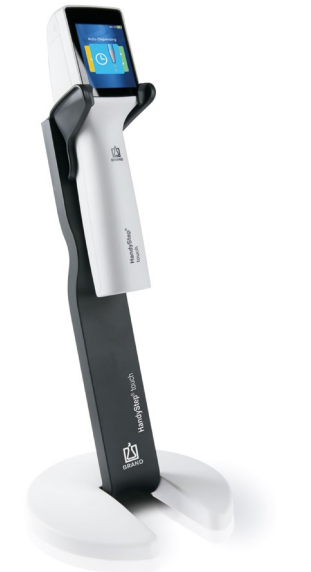
Support stand with HandyStep® touch