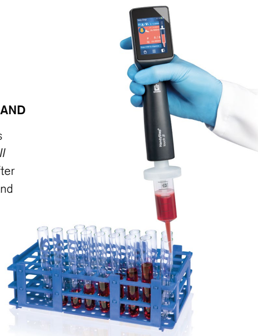
Sequential dispensing with the HandyStep® touch S and PD-Tip //