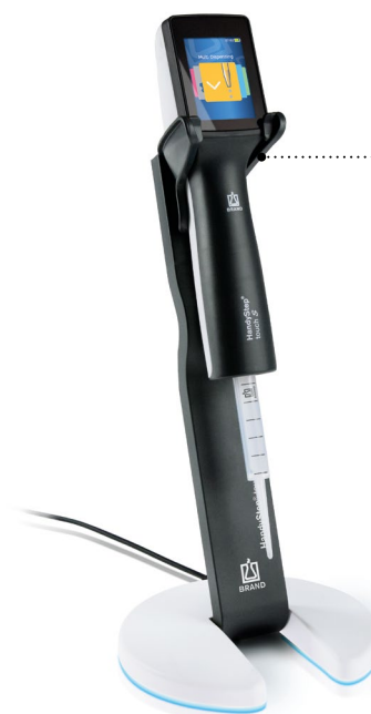
Charging stand with HandyStep® touch S and PD-Tip //