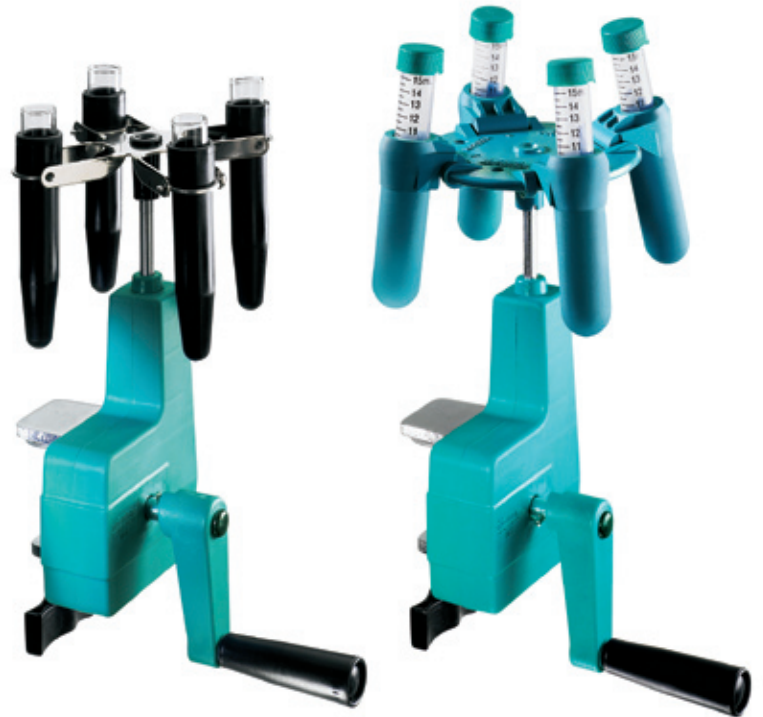
illustrated with rotor 1014 ↘90°

Rotor 1025 also accommodates a variety of other commercial tubes (also with round bottom) up to 15 ml. The tubes may have a max. length of 125 mm and a max. diameter of 17 mm.