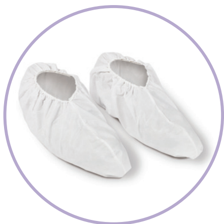
UNITRAX* Universal Traction.

KIMTECH PURE* A8 UNITRAX* Shoe Covers provide superior traction on a wider range of surfaces.