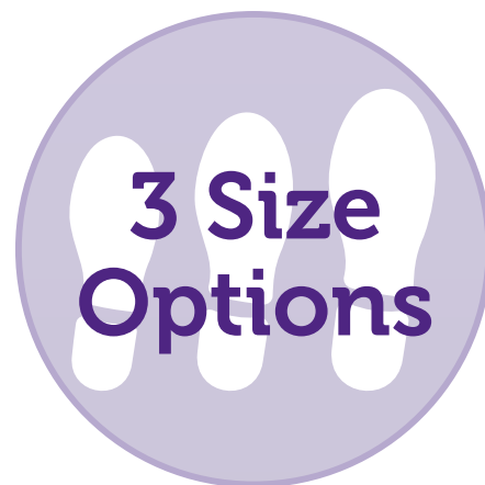
Available in 3 sizes.