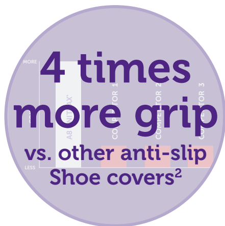
More Grip = Less Slip