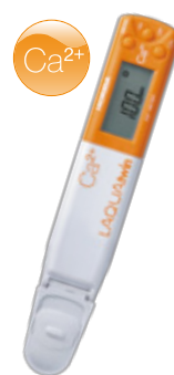
Calcium Ion Meter B-751