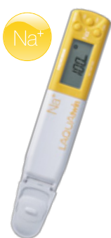
Sodium Ion Meter B-722