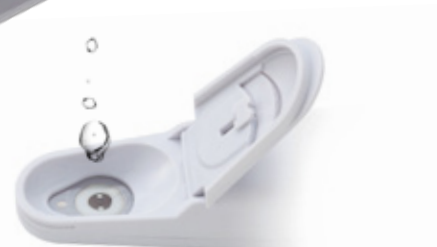
Accurate reading from only a single drop, in a few seconds