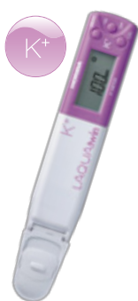
Potassium Ion Meter B-731