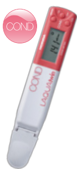
Conductivity(EC) Meter B-771