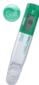
Salt Meter B-721