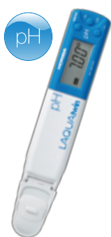
pH Meter B-711/B-712 B-713(US Only)