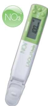
Nitrate Ion Meter B-741 (for crops) B-742 (for soil) B-743 (for general use)