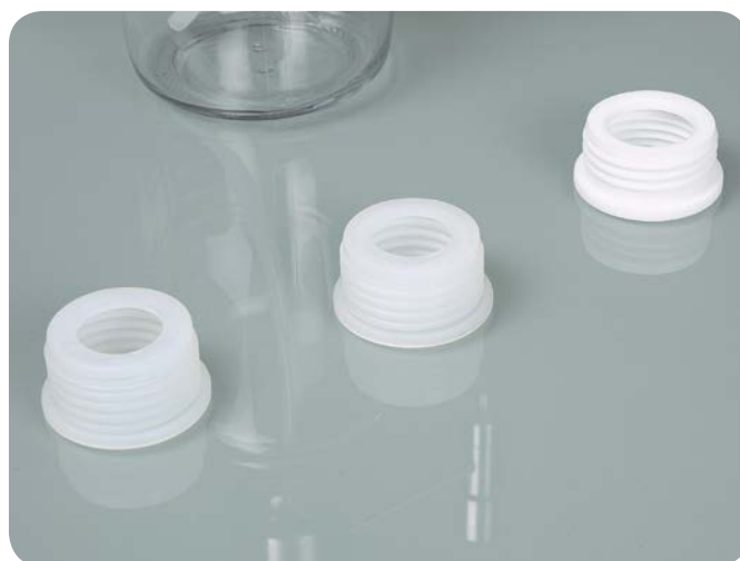
Thread adapter (accessories)