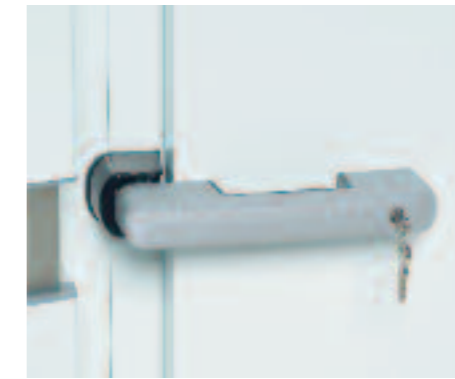
Lockable door handle with a luminous emergency entrapment release.