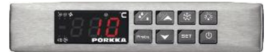
Combined digital temperature display with built-in control functions