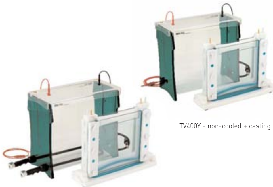
TV400YK - cooled + casting