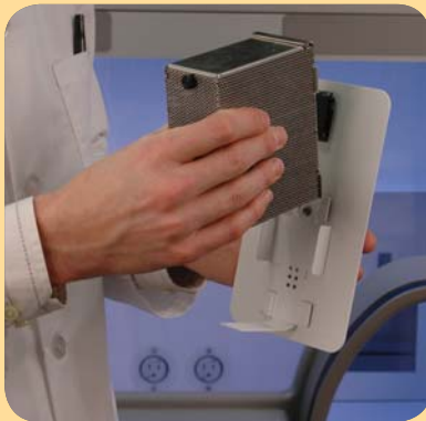
Easy Change Anatox & Catalyst Packs