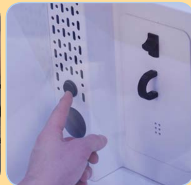
Interior Auto-Purge Button

For more information on the SHEL LAB BacBASIC: Call: +44 (0)1954 233100 Go To: www.camlab.co.uk