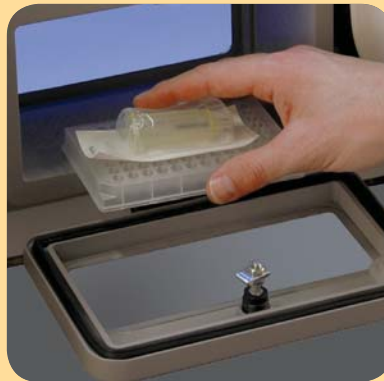
Central Pass Through Box