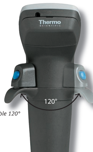
The finger rest is adjustable 120°