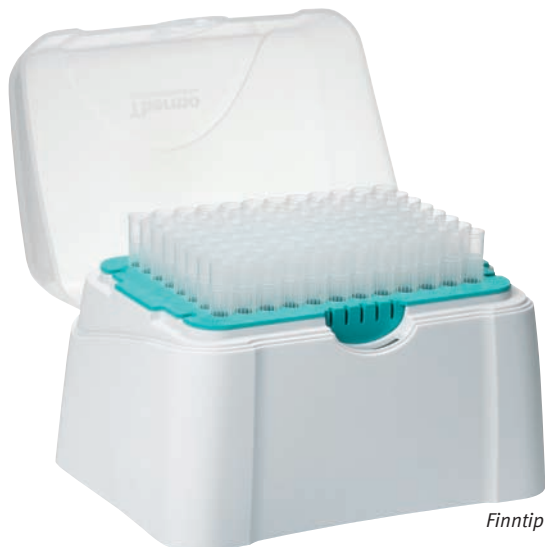
Finntip Flex 1200

Finntip Filters are ideal for PCR and other amplification methods, or for any work where aerosol contamination might occur. Finntip Filters effectively eliminate carry-over contamination, ensuring the success of the application. Finntip Filters 0.2 - 1000 µl are certified to be free of DNA, DNase and RNase.