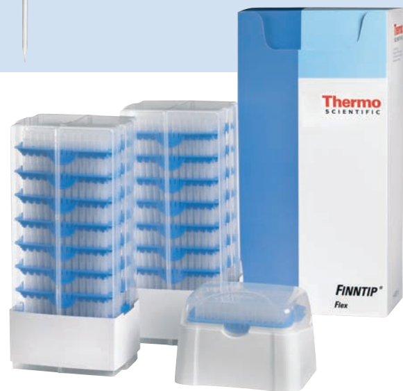
Finntip Flex 1000 Refill Starter Kit