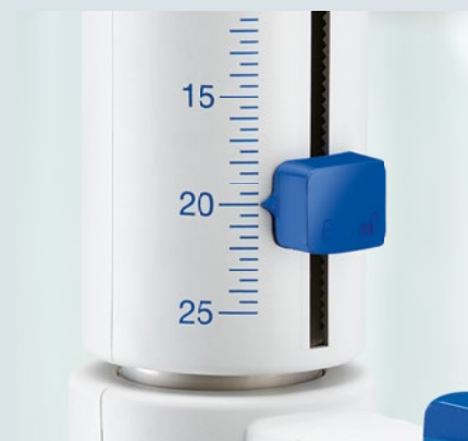
New! Optimized volume scale for clear visibility and precise volume adjustment