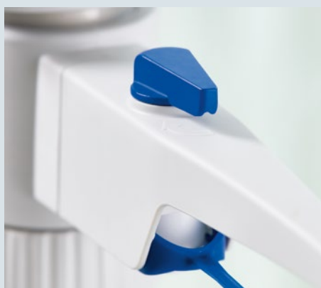
New! Perfected recirculation valve lever for easy setting of recirculation or dispensing position