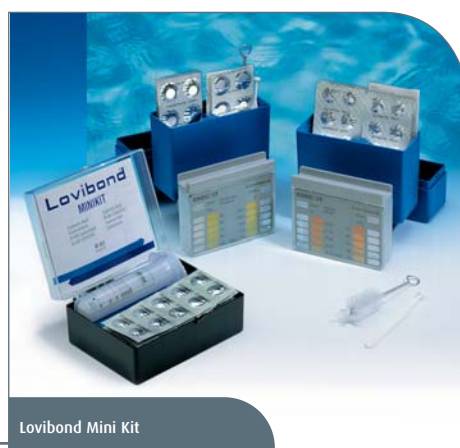
Lovibond Mini Kit