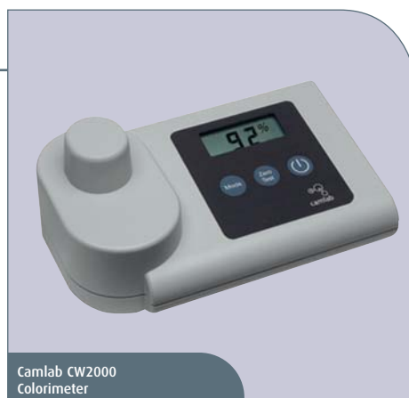
Camlab CW2070 Colorimeter