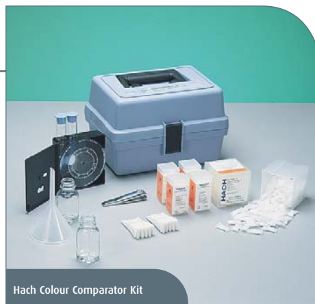
Hach Colour Comparator Kit