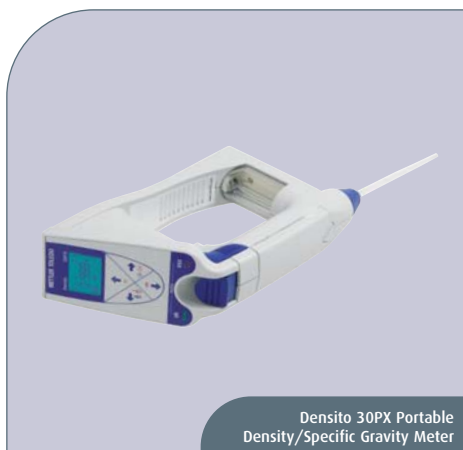
Densito 30PX Portable Density/Specific Gravity Meter