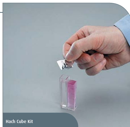
Hach Cube Kit