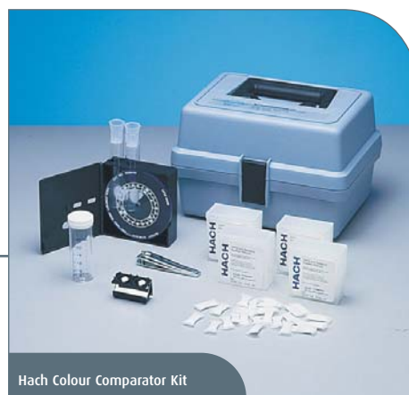
Hach Colour Comparator Kit