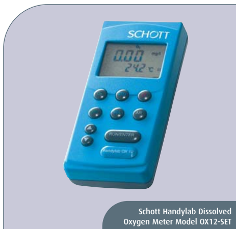
Schott Handylab Dissolved Oxygen Meter Model OX12-SET