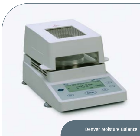
Denver Moisture Balance