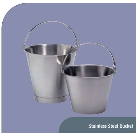
Stainless Steel Bucket

Manufactured from 304-grade stainless steel, graduated in 1-litre intervals, complete with handle.