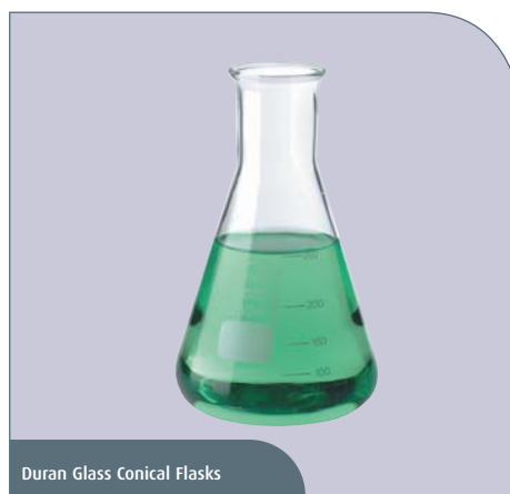
Duran Glass Conical Flasks