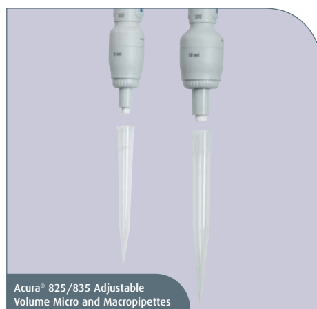
Acura® 825/835 Adjustable Volume Micro and Macropipettes