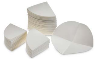
Quadrant folded filter papers

1 Ash is determined by ignition of the cellulose filter at 900°C in air