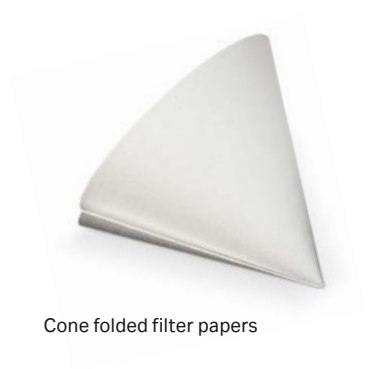
Cone folded filter papers

1 Ash is determined by ignition of the cellulose filter at 900°C in air.