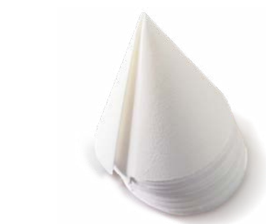
Cone folded filter papers

Customizable and available in different grades upon request.