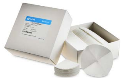
44 FF quadrant flat folded filter papers

Customizable and available in different grades upon request.