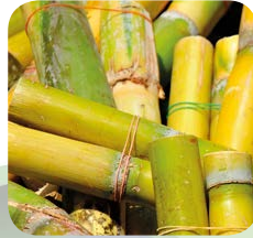
Sugarcane 100% renewable resources