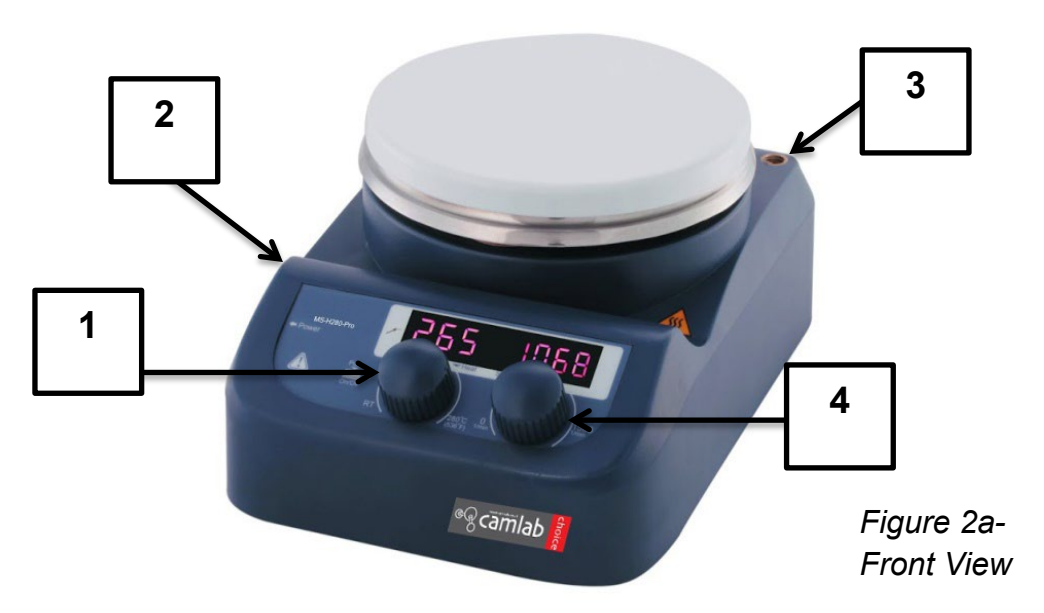
Diagram & Controls

The MS-H280-pro magnetic stirrer hotplate has independent controls for temperature and speed. Both of these functions can be used together and separately if required. For the stirring function, an appropriate magnetic stirring bar is required.