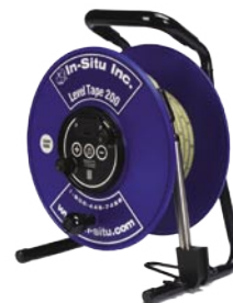
Level TAPE 200