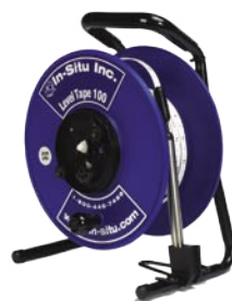
Level TAPE 100